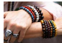
Multiple jewellery items (only one of each is allowed)