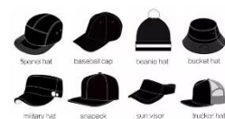
Hats and caps