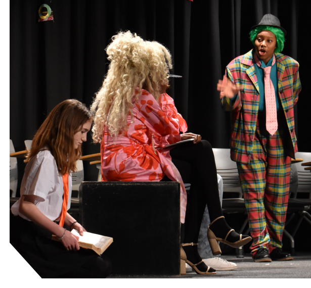
"It's wonderful to learn new things & join fun clubs."