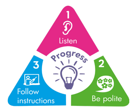
3 Golden Rules

SSOD Callout Teacher detention Warning Reminder On task Great progress Reward points Star of the hour